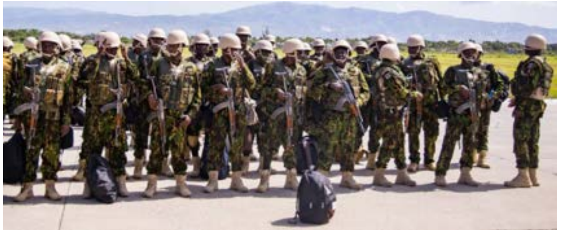
The 400 Kenyan officers currently in Haiti represent a significant portion of the MSS. Reports indicate that they have not received their full pay for the past two months.

One of the most pressing risks posed by these delayed payments is the potential damage to the morale of the officers on the ground. The Kenyan officers currently deployed in Haiti are operating under harsh conditions, including restricted movement outside their base in Port-au-Prince and a demanding environment more akin to military service than traditional police work. Cont'd Page 10